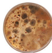
Before AP3000 II